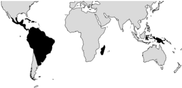
Boine snakes have a disjunct distribution, being found in South and Central America, Madagascar, and Papua New Guinea.

There are also many interesting patterns of distribution. For example, sometimes the same plants or animals can be found in widely separated areas, even either side of an ocean. These are known as ‘disjunct distributions’.