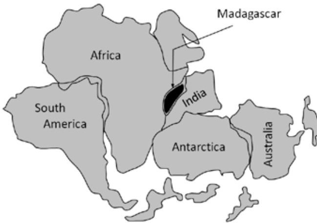
The hypothetical supercontinent Gondwana (Note that north America and Europe/Asia supposedly formed a separate supercontinent to the north called Laurasia)

Evolutionists actually have great difficulties explaining the distribution of plants and animals and this is clear from the disagreements among them. Some favour continental drift as the primary explanation for why the same plants and animals are often found on different continents. For example, they say that the ancestors of plants and animals now living either side of the Atlantic Ocean once lived together on the supercontinent, Gondwana. Then, millions of years ago, as Africa split off from South America, they were separated.