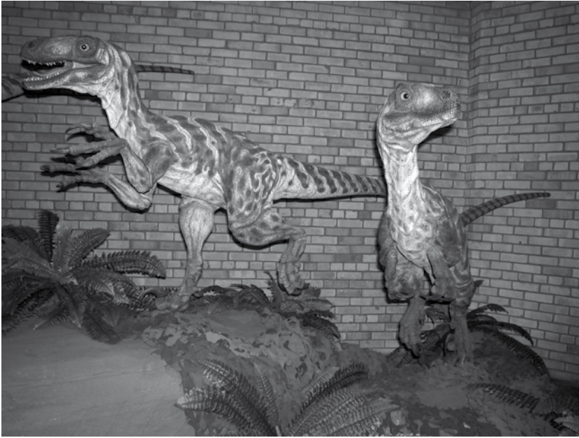
Figure 3. Pre-feather version of Deinonychus . It seems to make perfect sense without feathers. After all, the vast majority of Deinonychus fossils found have no trace of feathers, even when the preservation seemed to be exquisite.

One even more intriguing claim is that a Psittacosaurus (considered the earliest ancestor of horned dinosaurs like the Triceratops ) had ‘strand-like bristles’ (primitive feathers) on its tail. It must have been quite a fashion in those days! The fact is that this ornithischian (bird-hipped dinosaur) is not considered an ancestor of birds, although it shares with them a derived characteristic: the pelvic girdle (cladistics again). This is the only exhibited fossil that is clearly 3-D, so one can see more details. Yet those details do not really prove there are also feathers associated with the fossil.