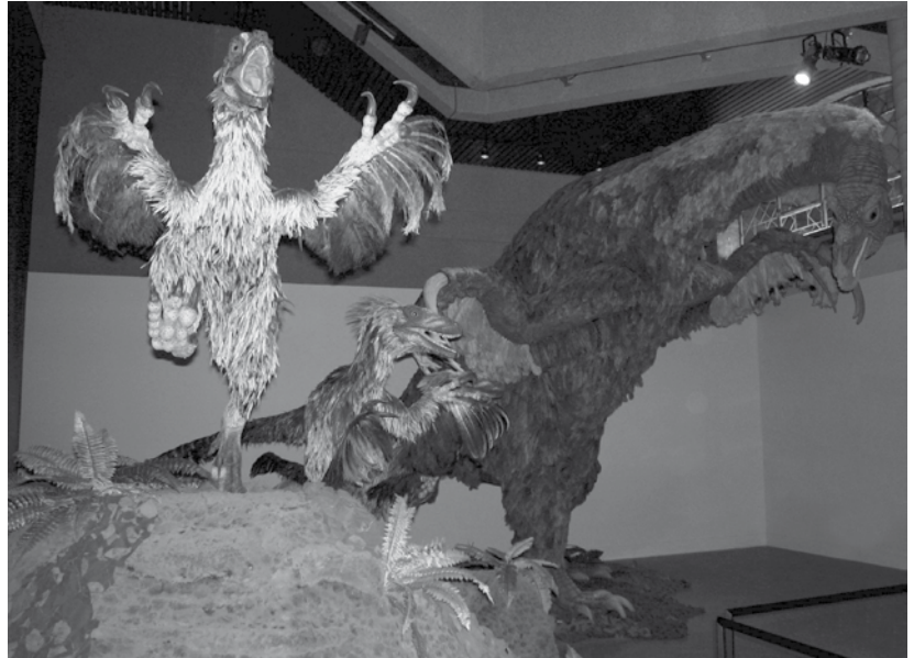
Figure 1. Deinonychus and Therizinosaurus (in the far background) abundantly decorated with feathers. It is still a mystery why such creatures would have had feathers, as none of the explanations available thus far are truly satisfactory. Insulation was not apparently needed as the climate was much warmer, and running after their prey would have been in fact hindered by such additions to their bodies.

Artful dodging of one category most people expect: the original entity that started the evolutionary changes. In fact cladistics seems to play with opened ends, postulating that the same characteristics could be ‘invented’ by different entities (not very clear if they were species, genera or whatever other taxonomic group) more or less in the same time. An extreme form of this seems to be the issue of the multiregional vs out-of-Africa hypotheses on the origin of modern humans. 4 One could not stop wondering: why is it that though cladistics is not about heritage, the main cladogram of the exhibit carries the word “heritage” in the very title? To start with, most visitors would not notice the discrepancy; and also the very purpose of the exhibition is to deeply impress the idea of common ancestry in the visitors mind. Not too much of a difference from using patently fraudulent information like Haeckel’s embryos in textbooks for over a century! 5 The Bible, on the other hand, does give us more than hy-