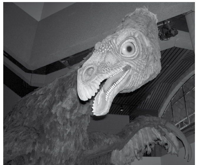
Figure 2. Detail of Therizinosaurus .

In order to convince the visitor about the authenticity of the feathers on these dinosaurs, a large panel with the hypothetical development of feathers presents the evolution from a single filament (stage 1) to the full, asymmetrical flight feather (stage 5). However, no clear evidence is provided in this exhibition. The microphotographs that claim to show v-shaped structures (features considered to be feathers) in the skin of Pterorhynchus are unconvincing. These structures could be collagen fibres or fossilization artefacts, and to an unbiased eye they could well pass as hairs. 8