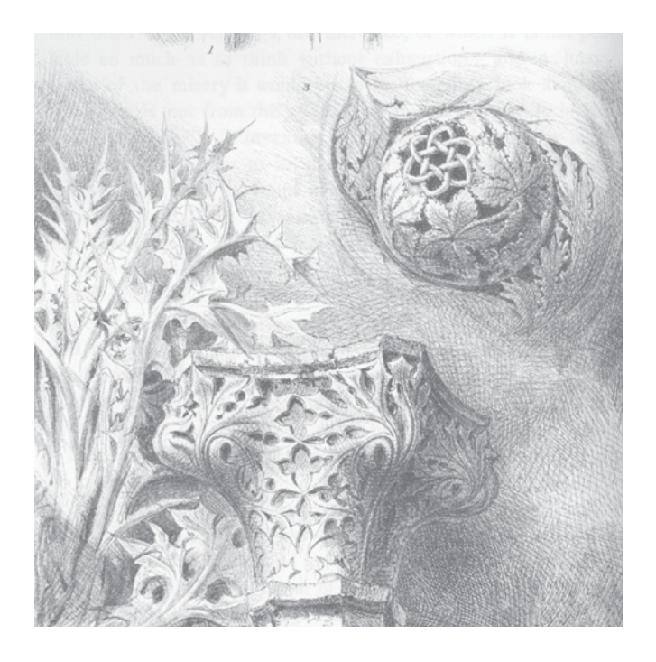
Figure 2. Ruskin's drawings illustrated the creative depiction of nature in carved ornament. (Ruskin, Plate 1).

Ruskin is credited with inspiring the Arts and Crafts movement and Art Nouveau, which drew inspiration from nature, which they saw as designed by God and emphasised ideas of individual creativity (figure 2). His influence is