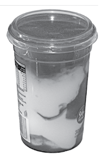
Figure 1. A transparent carton of fruit yogurt illustrates how friction in the viscous fluid stopped the motion initiated by mixing the fruit (dark colour) with the yogurt (white colour).

The inside of a cell has a density and viscosity somewhat similar to yogurt (figure 1). The stewed fruit (dark colour) added to the yogurt during manufacture can be seen swirling out into the white yogurt. The fruit has not continued to disperse throughout the vogurt. It was completely stopped by the initial friction. This is like what happens in a cell-any movement is quickly dampened by friction forces of all kinds coming from all directions.