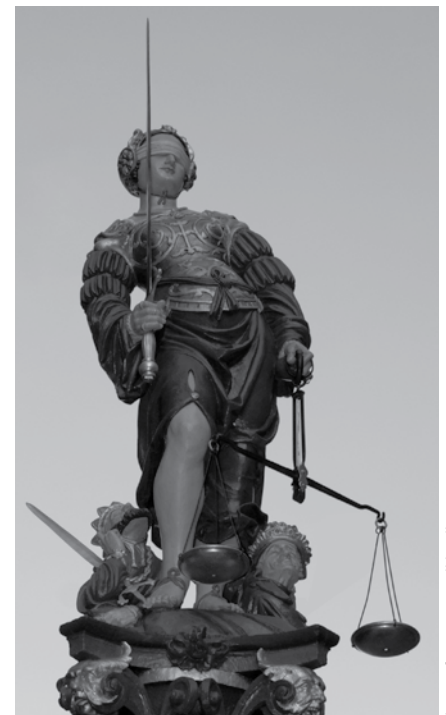
Law courts—flawed justice

Anti-creationists often say that creationism should be taught in non-science classes such as social