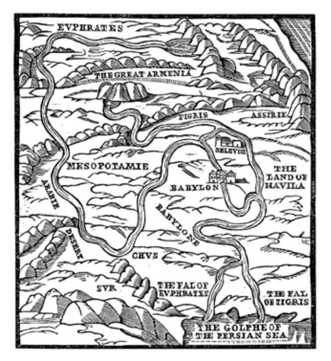
Figure 1. A map from Calvin's Genesis commentary (Calvin<sup>5</sup>)