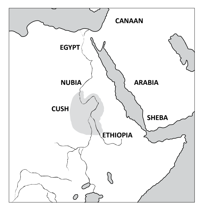
Figure 2. Location of Cush during pharonic times.

The Bible indicates that her principal motive was to test Solomon "with hard questions", <sup>29</sup> and not to obtain goods through an oracle of her god, as the Egyptian text recounts.