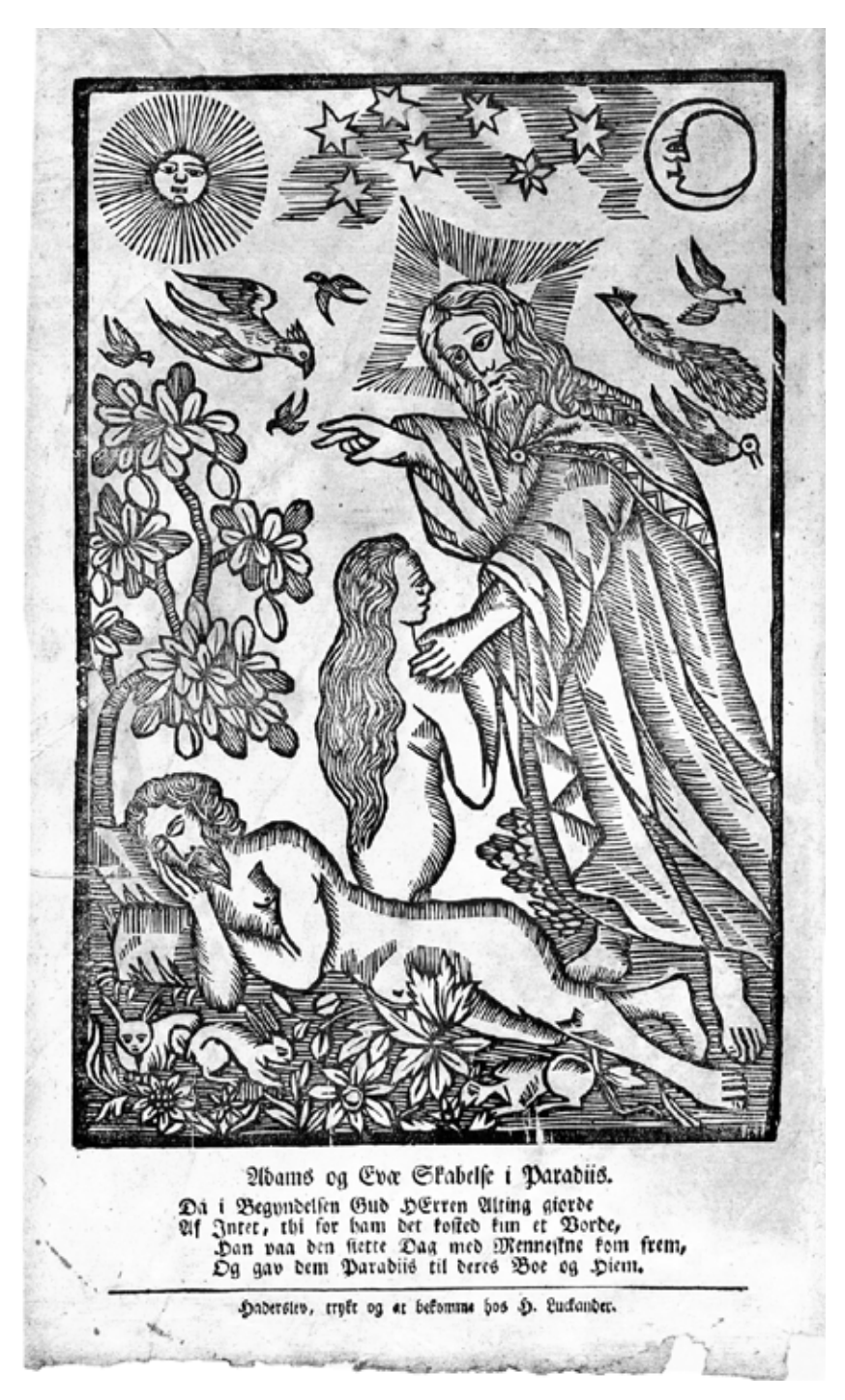
Figures 1. The creation of Adam and Eve in Paradise by Hinrich Luckander, 1759–1792.

Also, 1 Corinthians 15:49 says that all people bear Adam's image and, in