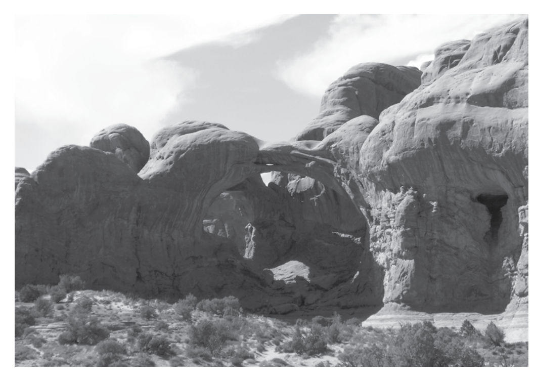
Figure 2. Double Arch, Arches National Park, Utah.

would have been eroded away both in front of it and behind it. The arch itself, as I recall, is only about one to two meters thick. In front and behind it is just air, since it is near the top of a high ridge. I find it easier to envision this arch forming in accordance with the secular model, not from Flood runoff. Also, as I recall, this arch is not smoothly rounded, which would have likely been the case if it had been the result of late-Flood runoff. I still believe the limestone was laid down by the Flood, but the arch itself was not very likely the result of late-Flood runoff.