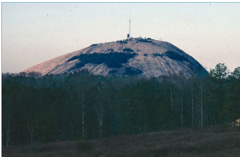
Figure 1. The Stone Mountain Granite monadnock (east of Atlanta, Georgia, USA) rises approximately 270 m above the surrounding hills. 13 It is proposed that the granitic melt rapidly formed and was intruded into overlying metamorphic overburden where it quickly crystallized. In places, the metamorphic overburden was subsequently eroded away, leaving the granite exposed. All of this occurred during the Genesis Flood. 14

The formation of granite and granite landforms has been studied by many young-earth creationists (figure 1). 3–11 Creationist research indicates that water-enriched granitic melts can form, move upward through the crust,