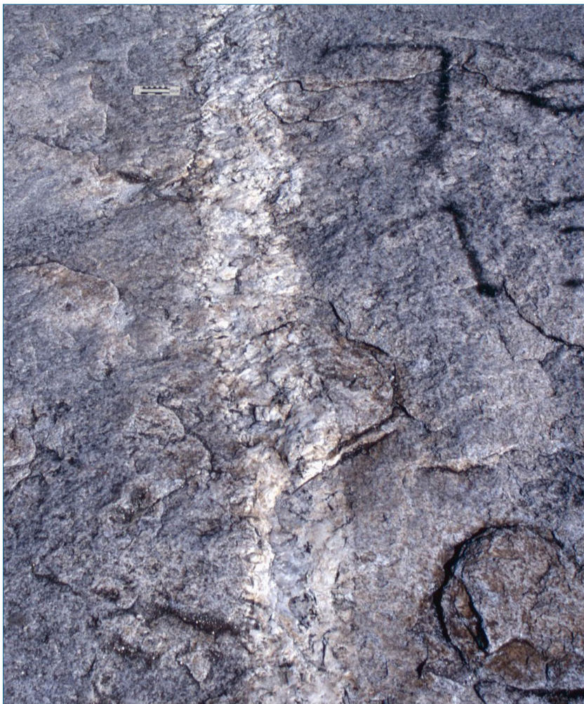
Figure 3. An aplite-pegmatite dike exposed in the Stone Mountain Granite. Naturalists contend that water-enriched pockets of feldspars and quartz within the granitic melt can very rapidly form pegmatites like this one. These features can quickly crystallize in hours or days. The width of the dike is approximately 33 cm.